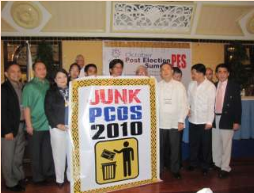
Filipino ITs, Oct. 2010