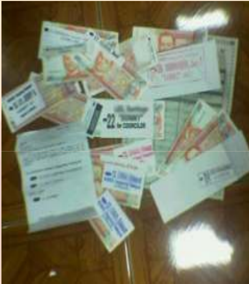
Vote buying in Catbalogan, Leyte