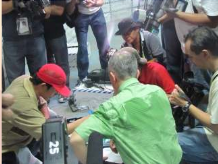
Antipolo: 60 PCOS machines exposed