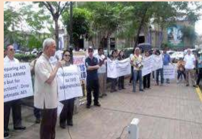
Poll watchers picket Comelec March 2011