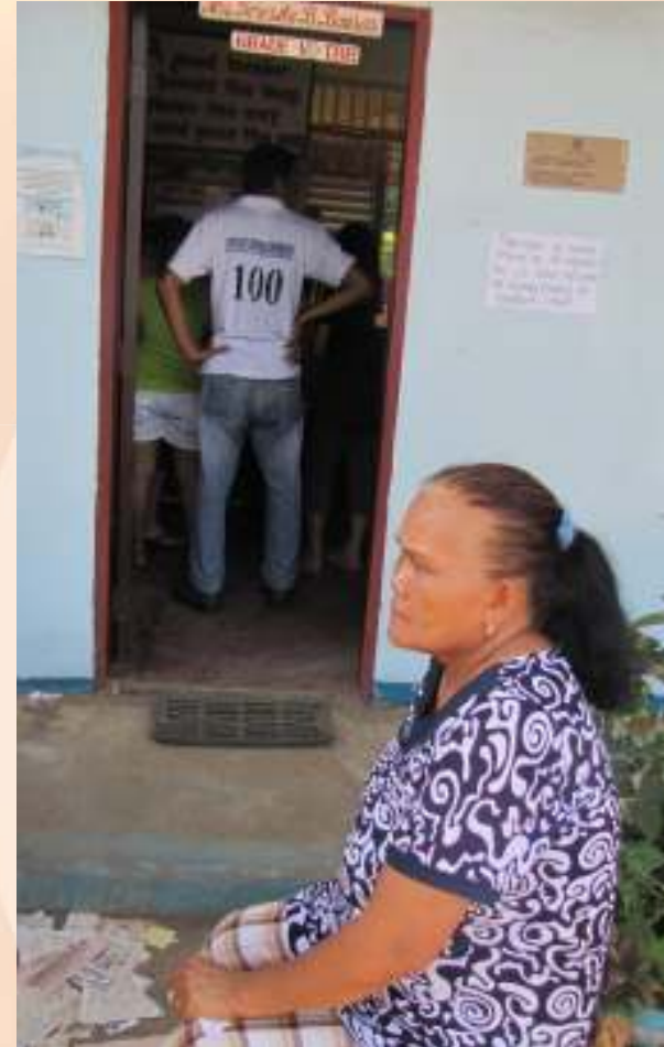
Disfranchised woman voter in Nasugbu, Batangas