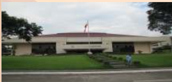
House of Representatives